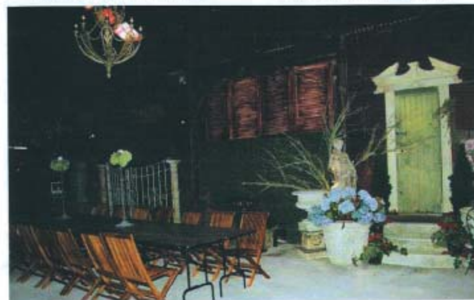
Through the cellar door lies an Italian-style hall for wedding receptions and functions.