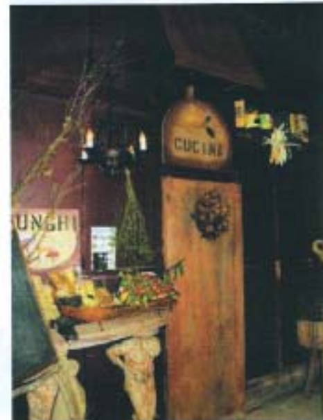
Karaka Point gives you the feeling you are in another country.