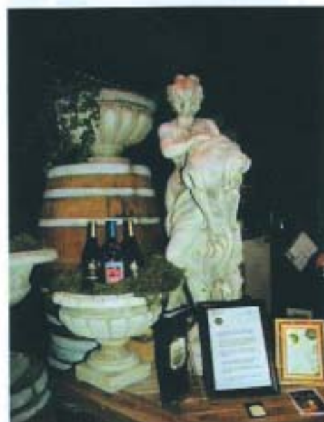
The cellar door has been a great success for the vineyard.