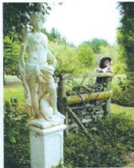
Statues and features are scattered throughout the property.